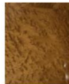
Existing Woodwork stays as is