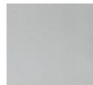
Seat Leather Garrett – Carressa C952 Platinum